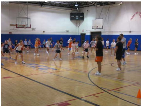
Girls week at RVC Rec Center