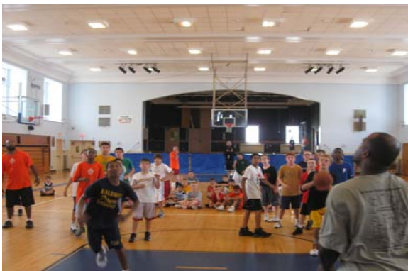
Boys week at St. Agnes